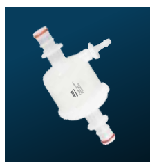
AseptiCap ® WL/WS 1", 250cm 2