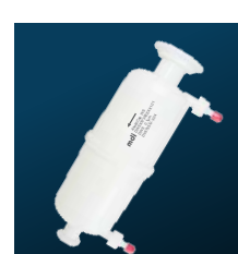
AseptiCap ® WL/WS 8", 2000cm 2