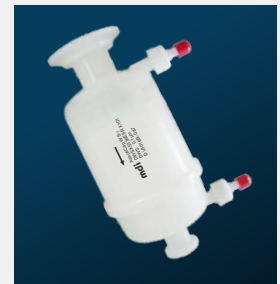
1 1/2" Sanitary Flange to 3/4" Sanitary Flange