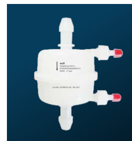
AseptiCap® with HighSecurity 1/2" hose barb connection