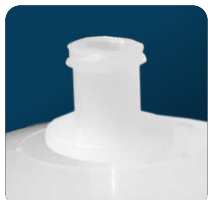
Female Luer Lock