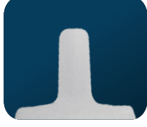
Male Luer Slip