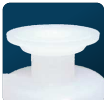
1 1/2" Sanitary Flange