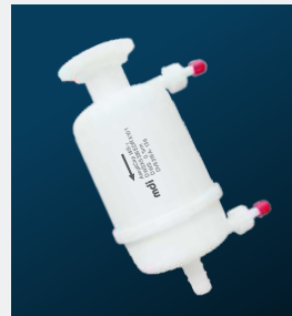
1 1/2" Sanitary Flange to 1/2" Barbed Hose

mdi AseptiCap® WL/WS filters are available in a wide range of end connections and are also customized to offer different inlet-outlet combinations to meet the unique connectivity needs in biopharmaceutical process assemblies where, for example, stainless steel components with sanitary flange connections are sometimes required to be connected to single use disposable systems through quick-connectors or hose barb connections.