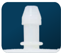
1/2" Single Stepped Hose Barb