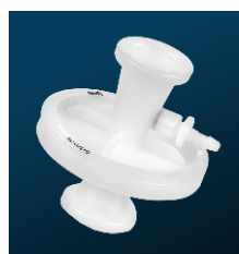
AseptiCap ® WL/WS 50mm, 20cm 2